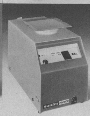
Precision Balance, Type KM 200/KM 1000