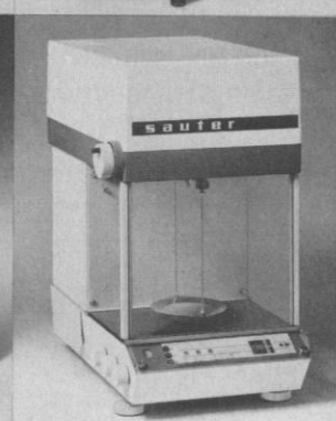
Analytical Balance, Type 404/13

SAUTER balances have earned a reputation for ease of operation, economy and practical technology. No wonder SAUTER balances are the choice in research and development laboratories, in industry and scientific institutions just about everywhere.