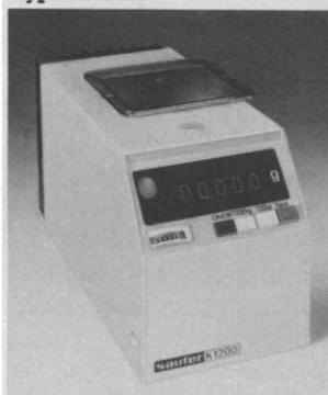
Electronic Precision Balance, Type K 1200