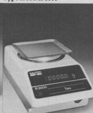
Electronic Precision Balance, Type R 300/R 3000