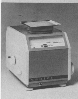
Precision Balance, Type SM 1600